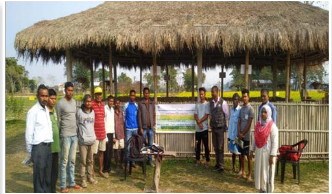
Vaccination on Reproductive Health and Mastitis Management at Maloibari block