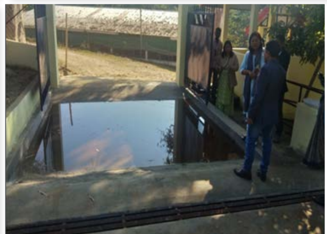
Wheel Dip at the entrance