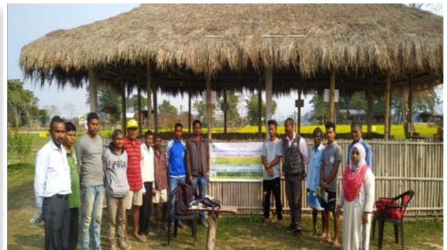
Technical trainings at farmers field conducted at different mustard clusters across Project districts