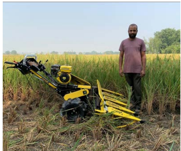
Paddy Reaper for paddy cultivation – saving time & labour

In a state like Assam, agriculture sector continues to support more than 75 per cent of the state