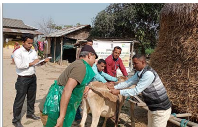
Vaccination on Reproductive Health and Mastitis Management at Maloibari block