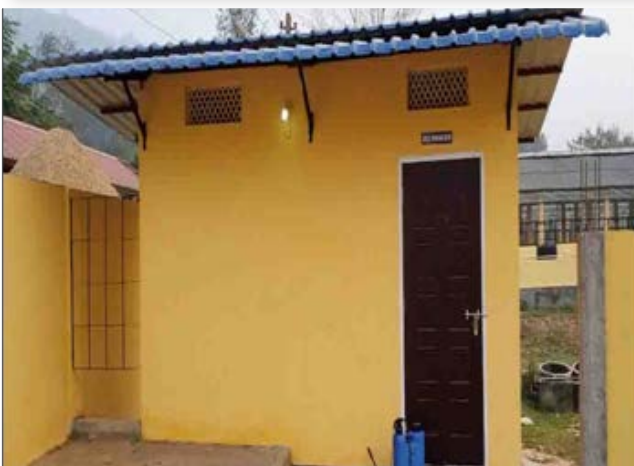
Security room & selling outlet