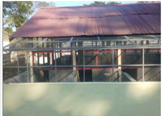
Wire netting above the half wall