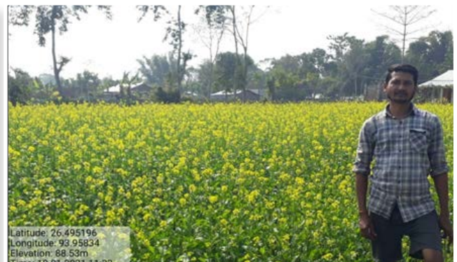
Field technical advisory at farmer's field by the technical team