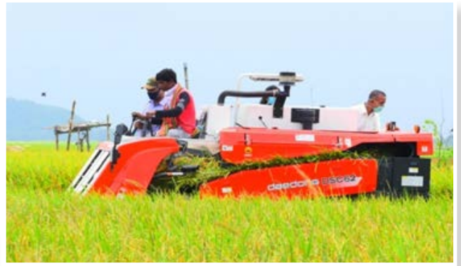
খেতি পথাৰত মিনি কম্বাইন হাৰভেষ্টাৰ

মিনি কম্বাইন হাৰভেষ্টাৰ দৰাচলতে কি আৰু ইয়াৰ সুবিধা সমূহ কেনেধৰণৰ তলত উল্লেখ কৰা হ'ল-