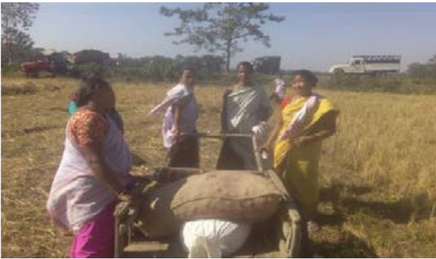
কম খৰছত অধিক আলু উৎপাদন লাভ

জিৰাটিলেজ অথবা হাল-কোৰ নমৰাকৈ কৰা আলু খেতি পদ্ধতিটোৰ প্ৰতি মহিলা কৃষক সকল অধিক আগ্ৰহী হোৱা দেখা গৈছে। এতিয়া হয়তো পাঠকৰ মনত এটা প্ৰশ্ন উদয় হৈছে - কিহৰ বাবে এই পদ্ধতিৰ প্ৰতি মহিলা সকল আগ্ৰহী হৈছে? এই প্ৰশ্নৰ উত্তৰত ছিপাবাৰ খণ্ডৰ তিতকুছি গাঁৱৰ মহিলা কৃষক সকলে জানিবলৈ দিছে এনেদৰে- জিৰাটিলেজ অথবা হাল-কোৰ নমৰাকৈ কৰা আলু খেতিৰ পদ্ধতিটো অতি সহজ