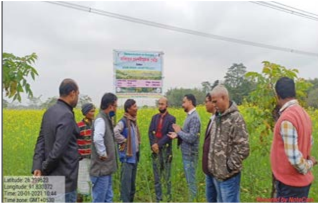
Visit of experts form DRMR, Bharatpur Experts to the mustard Demo plots in Darrang distict, Assam