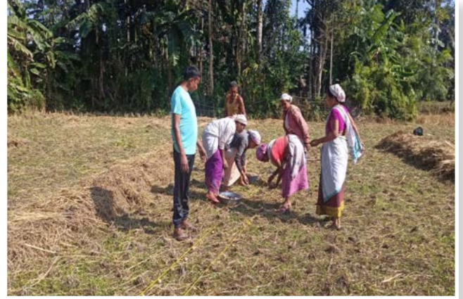
আলু বীজ ৰোপণত ব্যস্ত মহিলা কৃষক সকল