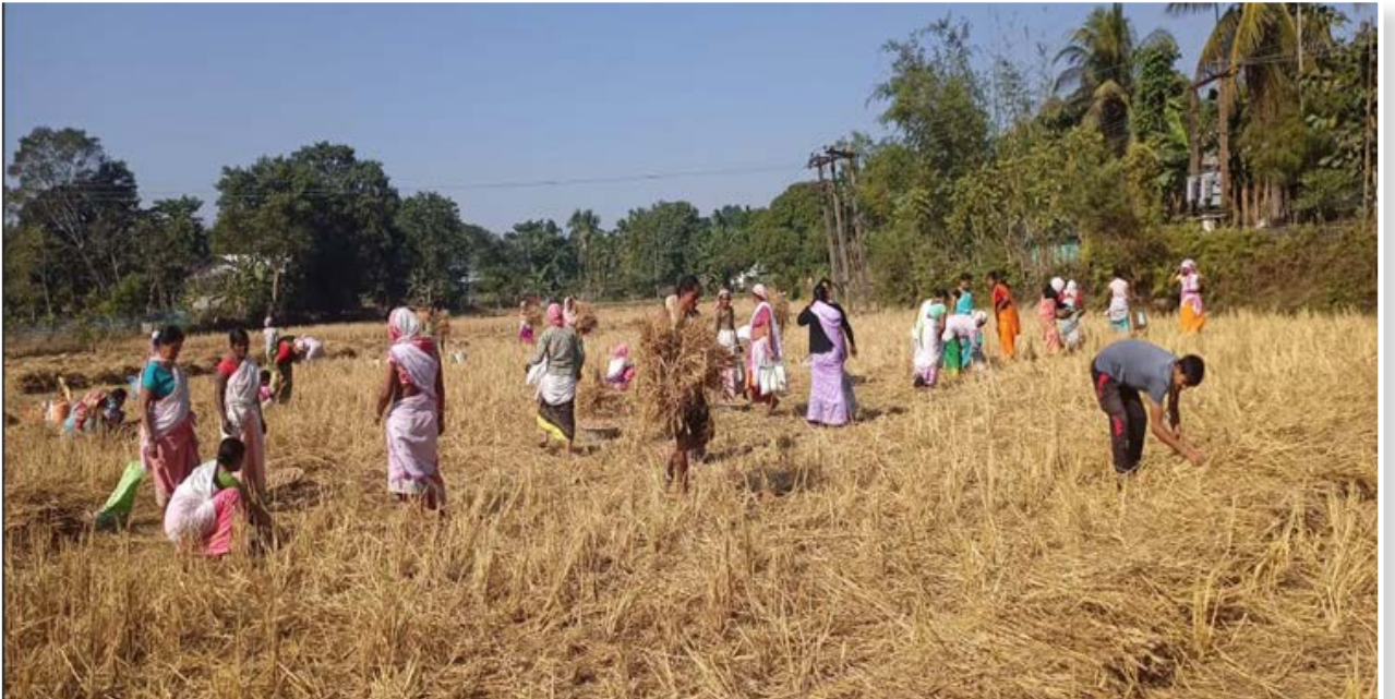
এপাৰ্ট প্ৰকল্পৰ অধীনত উন্নত কৃষি প্ৰযুক্তিৰ প্ৰতি আগ্ৰহী হোৱা গাঁৱৰ মহিলা কৃষক সকল

অসমৰ মানচিত্ৰত কৃষিজাত সামগ্ৰীৰ উৎপাদন আৰু বিপননৰ বাবে দৰং জিলাৰ এক স্বকীয় গৰিমা আছে। দৰং জিলাৰ পশ্চিম প্ৰান্তৰ বিভিন্ন গাঁৱৰ মহিলাই কৃষি বিভাগৰ “কৃষি প্ৰযুক্তি ব্যৱস্থাপনা অভিকৰণ” চমুকৈ ‘ATMA’ আৰু বিশ্ববেংকৰ বিত্তীয় সহযোগত ৰূপায়ণ হোৱা এপাৰ্ট প্ৰকল্পৰ অধীনত উন্নত কৃষি প্ৰযুক্তিৰ প্ৰশিক্ষণ ল’বলৈ আগ্ৰহী হোৱা দেখা গৈছে। বিভিন্ন আত্ম সহায়ক গোটৰ লগত জড়িত হৈ থকা এই মহিলা সকলে বিগত ২০১৮-১৯ বৰ্ষৰ পৰা ২০২০-২১ বৰ্ষলৈ হাল-কোৰ নমৰাকৈ কৰা আলু খেতিৰ উন্নত আৰু নতুন প্ৰযুক্তিৰ ওপৰত প্ৰশিক্ষণ লৈছে। লগতে হালধা, তিতকুছি গাঁৱৰ বহুলোকে এপাৰ্ট প্ৰকল্পৰ জিৰ’টিলেজ অথবা হাল-কোৰ নমৰাকৈ কৰা আলু খেতিৰ প্ৰদৰ্শনীমূলক খেতিৰ প্ৰতি আকৃষ্ট হৈছে। বিগত দুটা বৰ্ষত দৰং জিলাৰ ছিপাঝাৰ খণ্ডৰ অন্তৰ্গত হালধা, তিতকুছি, বাচাচুবা, জয়ন্তীপুৰ, নিজ সৰাবাৰী আদি গাঁৱত মহিলা আত্মসহায়ক গোট কিছুমানে হাল-কোৰ নমৰাকৈ কৰা কৃষি পদ্ধতিৰ সহায়ত আলু খেতি কৰি বিঘাত প্ৰায় ৩০ ৰ পৰা ৪০ কুইণ্টল