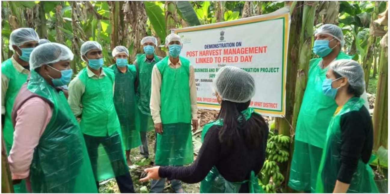
Post Harvest demonstration linked with a field day of Banana conducted at Bortari FPC in presence of FIG members and farmers at Chaygaon, Kamrup (R).