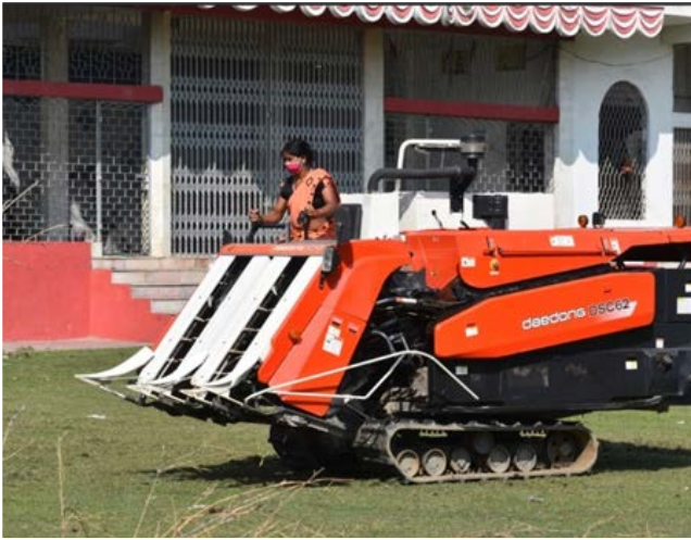
এপাৰ্টৰ অধীনত মিনি কম্বাইন হাৰভেষ্টাৰৰ ব্যৱহাৰ সমন্ধে প্ৰশিক্ষণ

সাম্প্ৰতিক সময়ত কৃষিখণ্ডত ধান চপোৱাৰ বাবে কৃষকে বিভিন্ন নতুন প্ৰযুক্তি ব্যৱহাৰ কৰিবলৈ আৰম্ভ কৰিছে। অসম এখন কৃষি প্ৰধান ৰাজ্য তৎস্বত্বেও কৃষিখণ্ডত কৃষক সকলে বিভিন্ন সমস্যাৰ সন্মুখীন হৈ আহিছে। বিশেষকৈ কৃষকসকলে ধান চপোৱাৰ সময়ত বহুতো অসুবিধাৰ সন্মুখীন হয়। প্ৰতিবছৰে হোৱা প্ৰবল বৃষ্টিপাতৰ ফলত ধান চপোৱাত পলম হয়। ধান চপোৱাত পলম হ'লে ধান অত্যাধিক পুৰঠ হৈ পৰে আৰু ফলত ধানৰ গুণগত মানদণ্ড আৰু ধান উৎপাদনৰ পৰিমাণ নিম্নগামী হৈ পৰে। এই সমস্যাবোৰৰ পৰা কৃষক সকলে