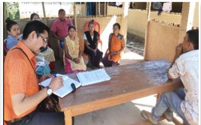
ILRI staff collecting data on need assessment study to address ASF