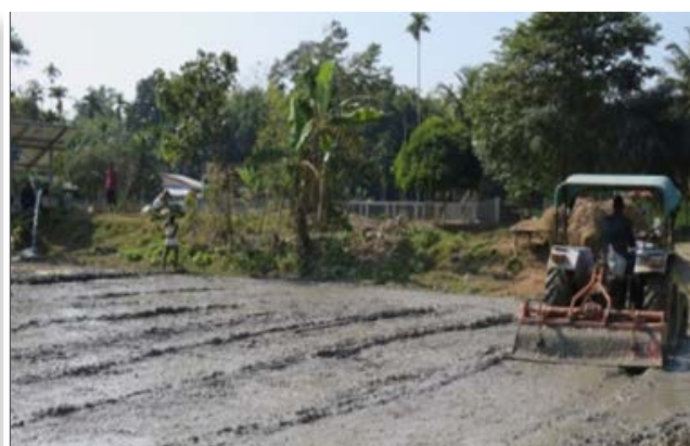
Preparation of nursery using wet DSR technology