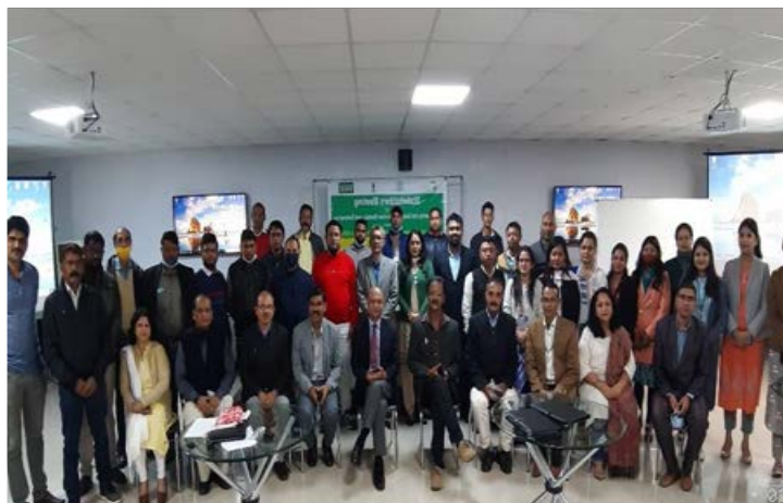
Participants of the Stakeholder's meeting