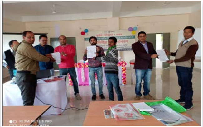
Mustard pamphlets, for advance cultivation, were distributed among 100 farmers during the training session in Skill development center, Patarighat, Mangaldai